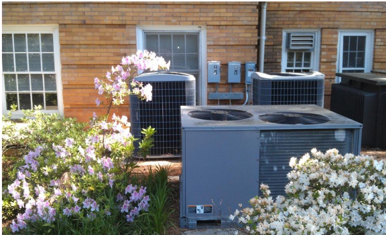
Azaleas planted next to HVAC equipment that blow hot air. The azaleas always get lace bugs first and worst.

Azalea lace bugs ( Stephanitis pyrioides ) are one of the most damaging pests of evergreen azaleas. They overwinter as eggs in azalea leaves and begin hatching in Spring. This is actually late compared to some other years, but I found the very first ones yesterday. I found them near HVAC units that blow hot air behind our administration building. This is my monitoring spot for azalea lace bugs because they always hatch here first. In addition the high temperature always leads to greater abundance and damage, too. This is a great example of how high temperature increases advances pest phenology and increases development rate leading to more generations per year.