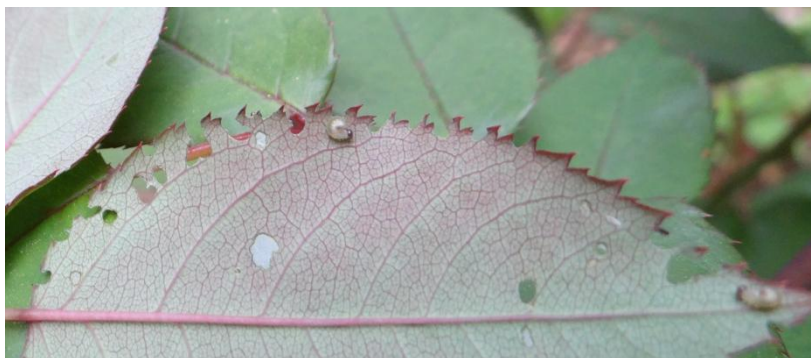
Tiny rose sawfly larva on knockout rose leaf.

I found these sawflies on knockout roses this week in Georgia. I also found some on my roses in Raleigh that were slightly smaller. They are probably the curled rose sawfly, Allantus cinctus , but I am waiting on a positive identification. In any case you can look for damage to leaves by these and other sawflies. Small larvae typically skeletonize the leaves. Larger larvae consume entire leaves. Scout for this damage and also for feces which are a sure sign of something feeding on your plants. If infestations are large a contact insecticides such as a pyrethroid or acephate can be applied. Conserve is also labeled for sawflies. Small infestations in home landscapes could be managed with horticultural oil or insecticidal soap.