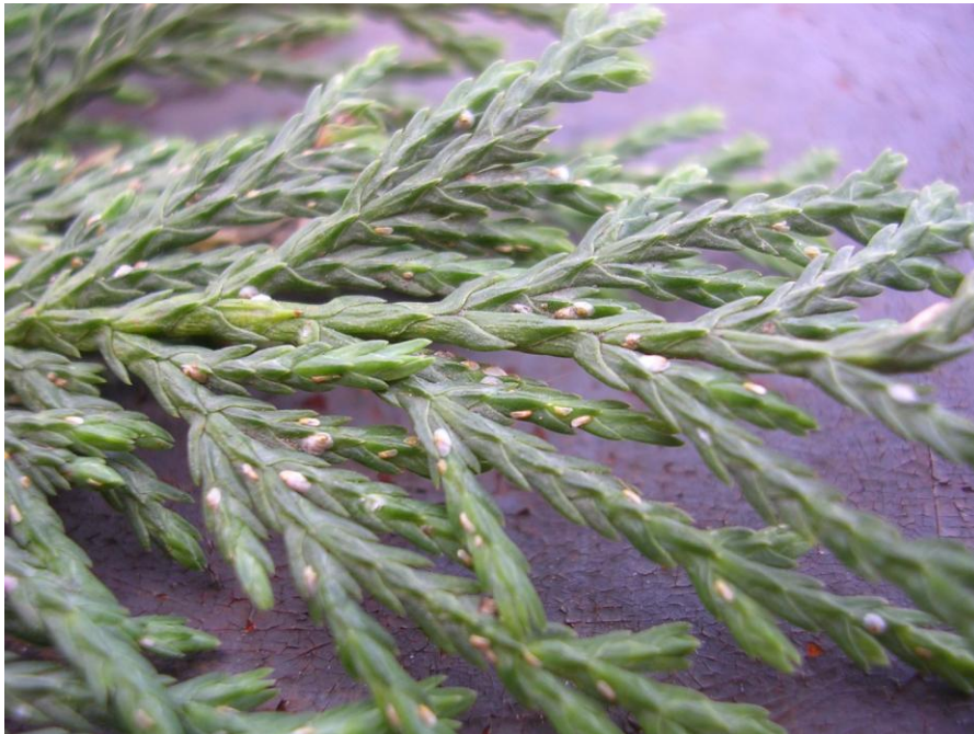
Heavy infestation of juniper scale on Leyland cypress. Adult females are white and round with a yellow center and resemble a fried egg.

Juniper scale, Carulaspis juniper , attacks some of the most commonly used plants in ornamental landscapes including all Juniper species, but also cypress species and false cypress. There is one generation per year in which females fill up their armored cover with eggs in spring from which crawlers hatch and look for new feeding sites. Infestations can lead to foliage that becomes yellow or brown and generally less lustrous than normal. Large infestations can cause the tips of branches to die and the plant to become sparsely foliated. Isolated infestations can be pruned off of plants. Natural enemies will often keep scale below damaging thresholds. However, in environments where natural enemies are not abundant control may be necessary. Horticultural oil will smother crawlers. Other chemicals such as dinotefuran (Safari), acetamiprid (TriStar), and pyroproxifen (Distance) and others can be used to manage infestations. More information on armored scale management can be found at: http://www.ces.ncsu.edu/depts/ent/notes/O&T/shrubs/note157/note157.html .